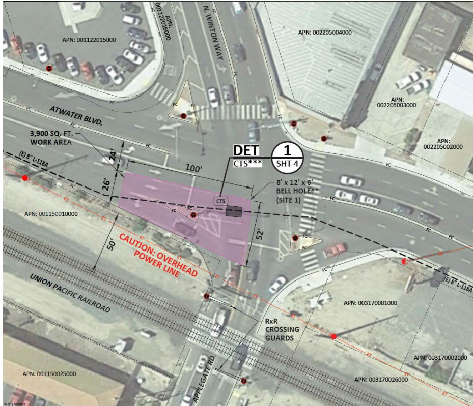
(Above) This is a map of the minimized workspace PG&E proposes to utilize throughout construction. Outside of construction hours, all equipment and materials will be stored offsite. (Below) A depiction of the proposed traffic control. All travel lanes will remain open except for the right hand turn from eastbound Atwater Blvd due to turn radius of the corner.

PG&E commits to the following actions to minimize impact to the city and public: